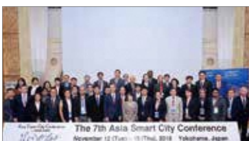
7th Asia Smart City Conference (2018)