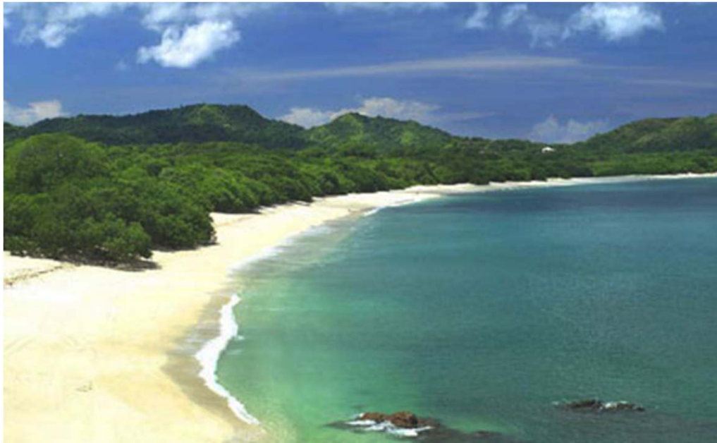
Da Nang beautiful and clean beach

2008-2010 : to solve urgent environment problems. This section has already been completed.