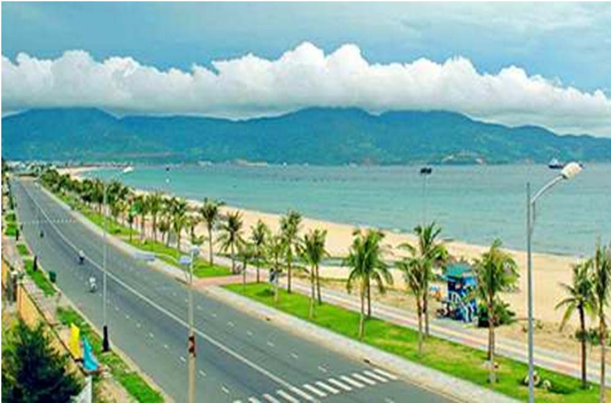
Da Nang beautiful and clean coastal road

2011-2015 : to achieve (cont'): 90% of solid waste to be collected and treated; waste recycle industry to be developed - 50% of collected waste to be recycled; 90% of urban population and 70% of rural population to have access to clean water; air pollution to be controlled - API to be lower than 100; green urban spaces to be developed, from 3 to 4 m 2 /person; biodiversity of the city's woodland to be protected.