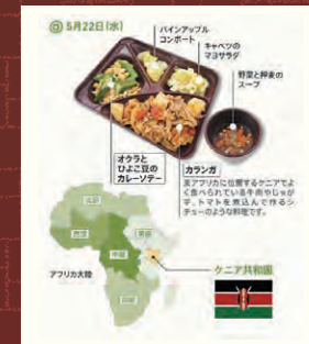
Kenyan home-styled dishes in junior high school lunches (2024)

With over 30 years since its inception, TICAD has served as an invaluable international conference on green growth and working toward SDGs. As the host city of TICAD 9, Yokohama aims to further deepen ties with Africa through the conference, share its green efforts and decarbonization initiatives with the world, and contribute to achieving a zero carbon society. In addition to the above, GREEN×EXPO 2027, the International Horticultural Exposition, will be held in Yokohama in 2027. Based on the theme "Scenery of the Future for Happiness", this event will greet visitors with an incredible display of flowers and greenery, and showcase green technologies that will lead us to a new society as we currently face planetwide issues such as climate change and the loss of biodiversity.