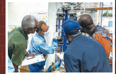
Waterworks: Training of African engineers in Yokohama (2024)