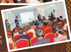
Seminar in Côte d'Ivoire (2019)