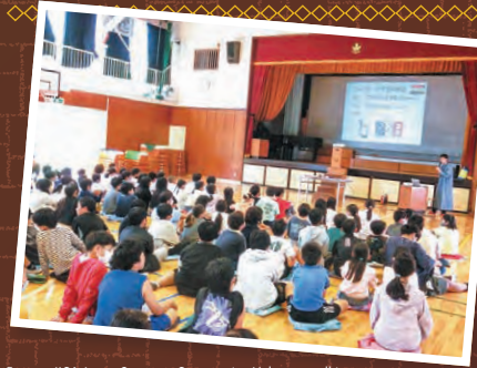
Former JICA Japan Overseas Cooperation Volunteer talking about Egypt (Kosugaya Elementary School) (2023)

Opportunities for exchange between African nations and city elementary and junior high schools are ongoing, with classes provided by former Japan Overseas Cooperation Volunteers and online gatherings. To date, over 200 elementary and junior high schools have participated in these programs. Since FY2023, African dishes have been served in junior high school lunches, proving to be a popular way to get to know Africa. "Student Project Connecting Yokohama to Africa" is part of the preparations for TICAD 9 in August 2025. Passionate students who took the initiative to sign up for this project will be working together as a group for six months, then will present their results in a video. Offering children and youth the opportunity to experience different cultures as part of their everyday lives not only gives them an international perspective, but it also helps diversify their values.