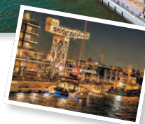
The dynamic illuminated Hammerhead Crane

Enjoy panoramic views of the city from the air!