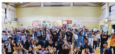
Online Tsuzuki-Botswana gathering