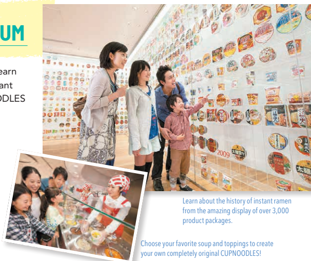
Learn about the history of instant ramen from the amazing display of over 3,000 product packages.

📍 2-3-4 Shinko, Naka-ku, Yokohama ☎️ 045-345-0918 🕒 10:00 a.m. - 6:00 p.m. (final entry: 5:00 p.m.) 🗓️ Tuesdays (Closed the following day when Tuesday falls on a holiday) 📍 8 minutes on foot from Minatomirai Station or Bashamichi Station on the Minatomirai Line 🌐 https://www.cupnoodles-museum.jp/en/yokohama/