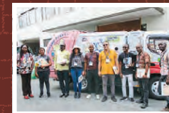
Waste management: Visit to the collection office (2023)