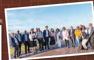
Port operations: Observers from African Union Development Agency (AUDA-NEPAD) (2024)

The City of Yokohama and various African nations took advantage of the opportunity of the fourth Tokyo International Conference on African Development (TICAD IV) in 2008 to further strengthen ties. As an international city, Yokohama shares its urban problem solving expertise and technologies to help advance urban development and economic growth in Africa.