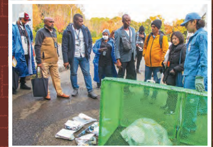
Waste management: Explanation of collection operations (2023)

Working together with the government, the Japan International Cooperation Agency (JICA), international organizations, and Yokohama businesses, the City of Yokohama promotes initiatives to contribute to growth in Africa across a variety of domains. Since it first dispatched a city worker to Kenya in FY1976, Yokohama has continued to provide waterworks support in countries across Africa. Leveraging its experience achieving a roughly 43% reduction in waste over 10 years starting in FY2001, the city provides regular waste management training to national and municipal workers in Africa via the African Clean Cities Platform (ACCP), which was co-founded by the Japanese Ministry of the Environment, JICA, African countries, and other parties. Yokohama also actively takes in trainees who want to learn about streamlining port logistics and operational management. As a city that achieved tremendous growth following the opening of its port to international trade in 1859, Yokohama possesses technologies and expertise that can be put to good use in rapidly growing African cities.