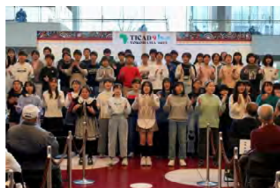
アフリカン ステージ 桜岡小学校による合唱（2月）