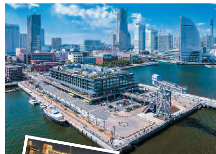
Surrounded on three sides by the ocean for a beautiful seaside view

📍 2-14-1 Shinko, Naka-ku, Yokohama ☎️ 045-211-8080 🕒 11:00 a.m. - 10:00 p.m., weekends and holidays: 10:00 a.m. - 10:00 p.m. (differs depending on the shop) 🗓️ Irregular holidays 🕒 10 minutes on foot from Bashamichi Station on the Minatomirai Line 🌐 https://www.hammerhead.co.jp/