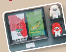
On the stadium tour, you can see memorabilia from the Rugby World Cup 2019™

With a seating capacity of nearly 72,000, this is one of the largest stadiums in Japan, and the home field of the J1 League Yokohama F. Marinos, and the Japan Rugby League One Yokohama Canon Eagles. The Rugby World Cup 2019™ championships were held here where the South African team won.