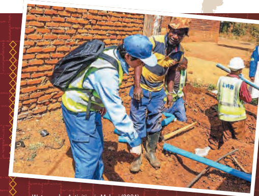
Waterworks: Activities in Malawi (2024)