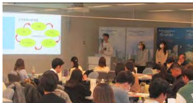
「学生プロジェクト」中間発表会

2月には、JICA 研修「アフリカにおける女性のビジネス・起業の推進」にアフリカ7か国から女性起業家や女性活躍推進担当の行政官などが参加し、横浜市の男女共同参画に向けた施策の研修・視察や、市内の女性起業家との交流などが行われました。