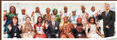
Japan-Africa Businesswoman Exchange Program (2023)