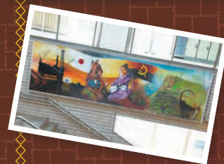
This giant murals at Center Kita Station were created and gifted to Japan by the Republic of Angola as a symbol of friendship