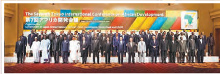
TICAD 7 group photo