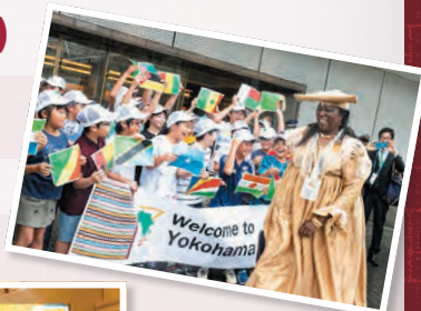
Children welcoming guests at TICAD 7