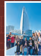
Port operations: JICA port security function improvement trainees (2024)