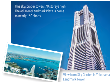
View from Sky Garden in Yokohama Landmark Tower

This skyscraper towers 70 storeys high. The adjacent Landmark Plaza is home to nearly 160 shops.