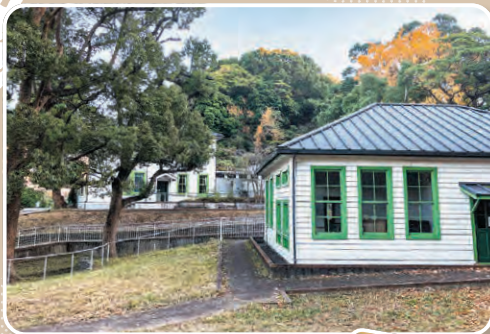
Nagahama Hall (left) and the former bacteriology laboratory (right)

Monument bearing the nameplates of past awardees of the Hideyo Noguchi Africa Prize