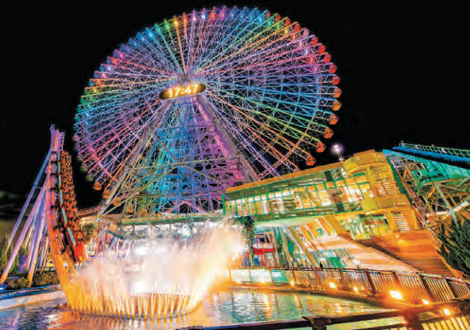
The beautiful lights of Cosmo Clock 21, a giant Ferris wheel

📍 2-8-1 Shinko, Naka-ku, Yokohama ☎️ 045-641-6591 🕒 11:00 a.m. - 8:00 p.m., weekends and holidays: 11:00 a.m. - 10:00 p.m. (ride cutoff time may end early when crowded) 🗓️ Thursdays 📍 2 minutes on foot from Minatomirai Station on the Minatomirai Line 🌐 http://cosmoworld.jp