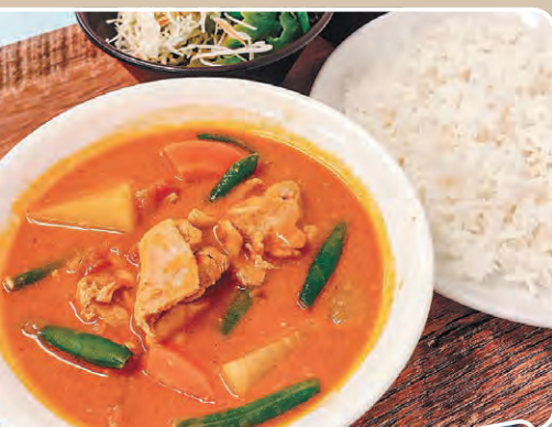
Ghanaian chicken, tomato, and peanut stew