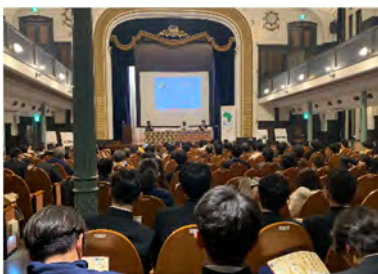
AFRICA CULTURE & SPORTS EVENT （2月）