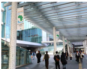
横浜駅西口駅前広場での TICAD9 フラッグ掲出（1月）

市民の皆様向けには、横浜駅周辺でのポスター及びフラッグ掲出のほか、TICAD 9 開催 200 日前の機会を捉え「AFRICA CULTURE & SPORTS EVENT」、「アフリカン ステージ」、「デジタルスタンプラリー」など、アフリカの文化に触れることのできるイベントを開催し、機運醸成に取り組んでいます。