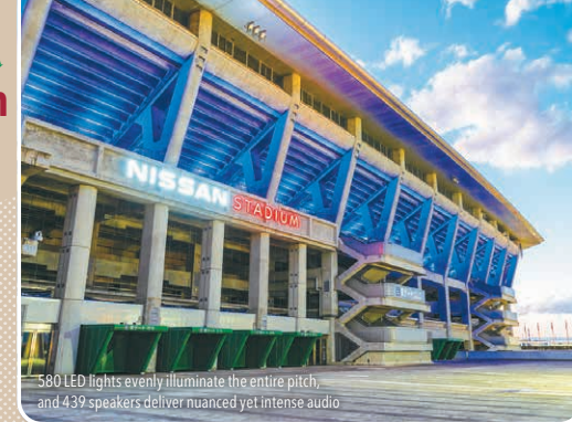
580 LED lights evenly illuminate the entire pitch, and 439 speakers deliver nuanced yet intense audio